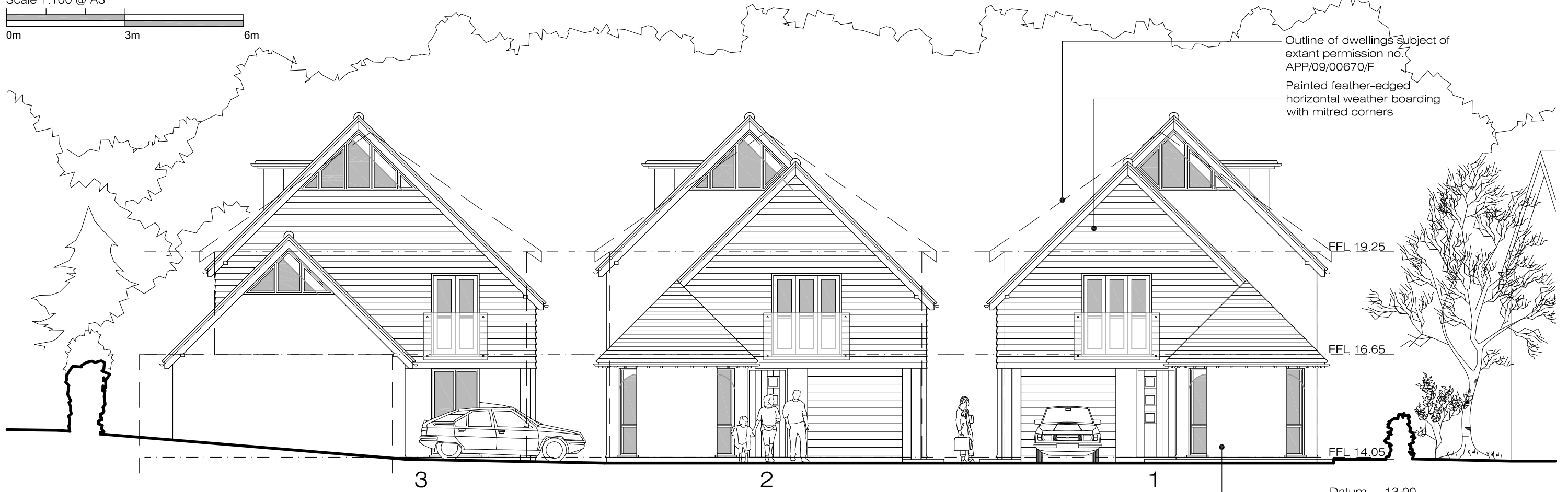
Proposed Front/North-East Elevation

This drawing is for Planning application purposes only and is copyright of Etchingham Morris Architecture Ltd.