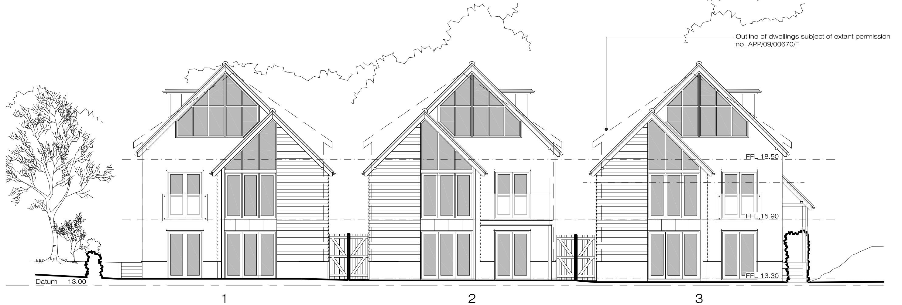
Proposed Rear/South-west Elevation