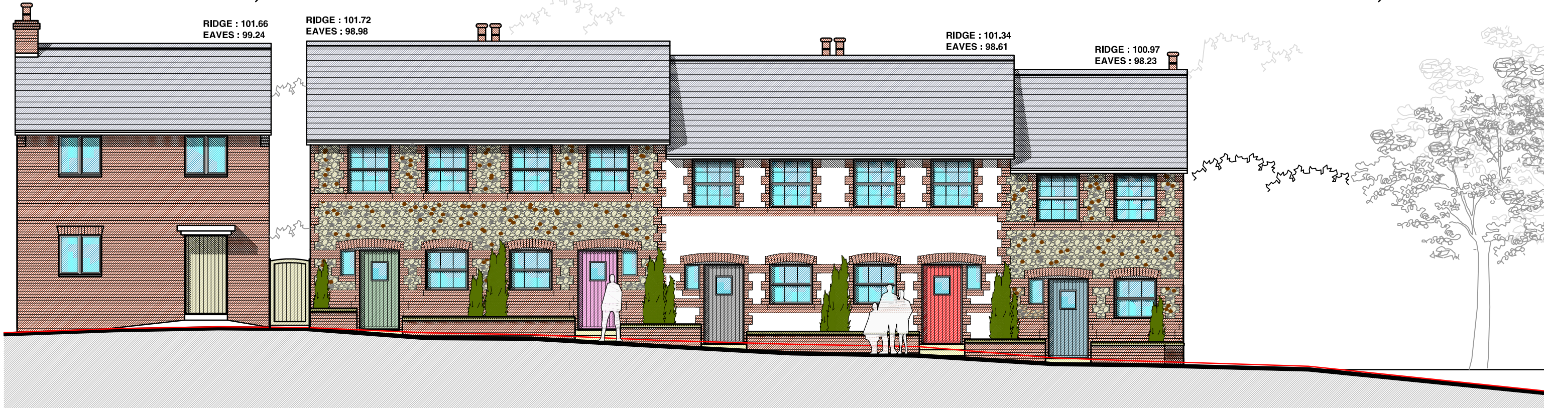
REAR ELEVATION (SOUTH WEST) SCALE 1:100